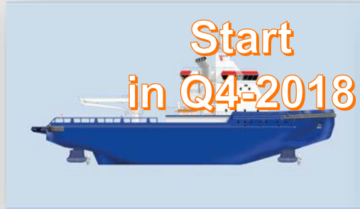
Type: Icebreaker Owner: FSUE Atomflot 3 x W8V31