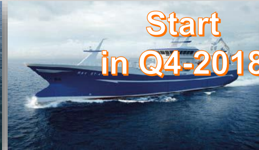
Type: Fishing vessel Owner: P. Hepsö Rederi 1 x W8V31