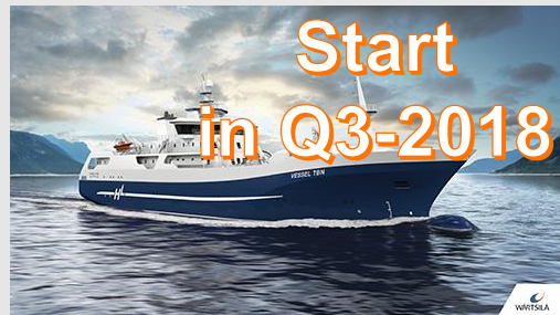
Type: Processing vessel Owner: Hav Line 1 x W10V31