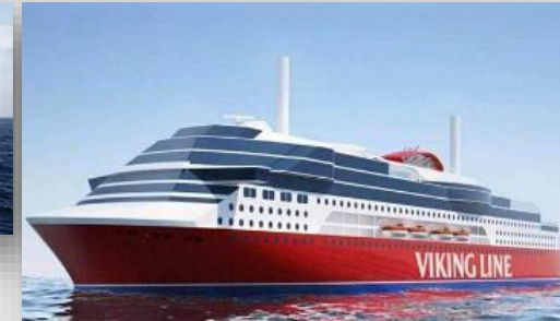
Type: RoPax Owner: Viking Line MoS 6 x W10V31DF