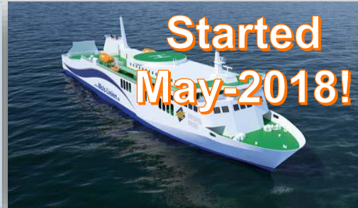
Type: RoPax Owner: MolsLinien 2 x W8V31