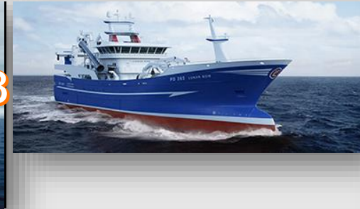
Type: Fishing vessel Owner: Lunar Fishing 1 x W10V31