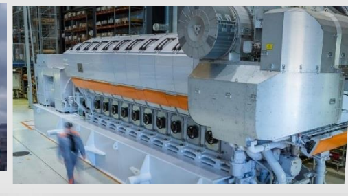
Type: Energy Production Owner: Benndale 2 x W20V31SG