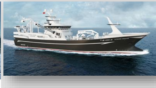
Type: Fishing Vessel Owner: Strand Senior AS 1 x W8V31